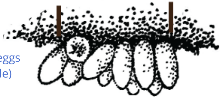
lady beetle eggs (not to scale)