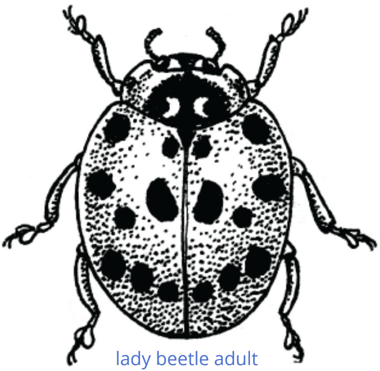
lady beetle adult